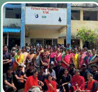
The Emmaus Florence Home Foundation community in Tamil Nadu

The water purifier will be installed at the Foundation's Killai Centre which, at present, supports more than 75 orphaned children, 25 women and 200 local families.