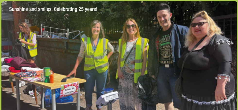
Sunshine and smiles. Celebrating 25 years!

As we look ahead to the next 25 years, we remain committed to providing a safe and supportive environment for people to rebuild their lives. We hope you continue supporting us in any way you can – reading our newsletter, donating, volunteering, or simply spreading the word.